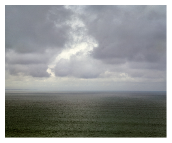
Fig. 2 Horizon 26, 2008, FH 092 from the series "Beginning of Time"

Perhaps art has lost something in the last fifty years – namely the accomplishment which results from the elitist striving for genius. But something has also been added: Let us call it a return to archetypical forms in the sense of overcoming bana-