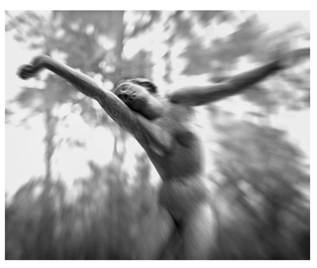
Fig. 15 Skulpture\ Photo\ 14 , after G. Kolbe "Fountain of Dancers", 1981, FS 015

which remains hidden in normal presentation. That apparently has something to do with a heightened 'truth of the object' or also with the visible traces of the ageing process, which we unconsciously perceive as a gain of information. But this fine structure cannot be achieved through heightened image sharpness alone. It also involves rendering the finest colour transitions and nuanced shadows. I have experienced this effect especially when looking at the photographs of Jean-Baptiste Huyn, who takes his portraits with the 120 mm macro lens of his Hasselblad.