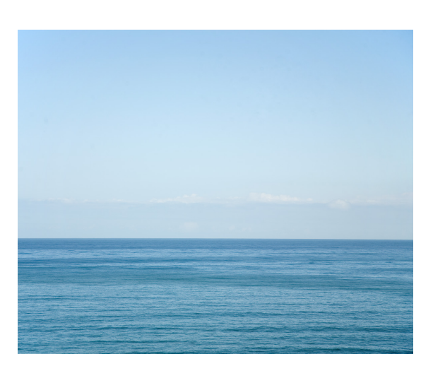
Fig. 7 Horizon 13, 2008, FH 087 from the series "Beginning of Time"

NL – When looking at the series Beginning of Time, what comes to mind are concepts like endlessness, primeval time, eternity. To what extent is your photography concerned with the dimension of time, and if it indeed plays a role, how is this dimension reflected in other parts of your work?