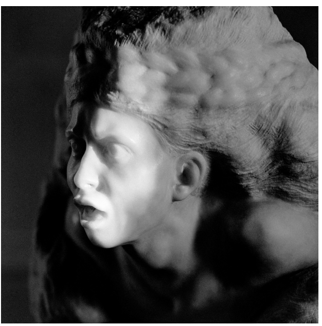
Fig. 5 Skulpture Photo 2, after A. Rodin The Storm", 1985, FS 002

With this simple formula you can relatively easily distinguish, in your own mind, art photography from holiday photos. You only need to look at a relatively large number of photos, and after two weeks see which ones you still remember. These are then 'art' in the sense that art is what evokes lasting emotions or essential thought-provoking impulses.