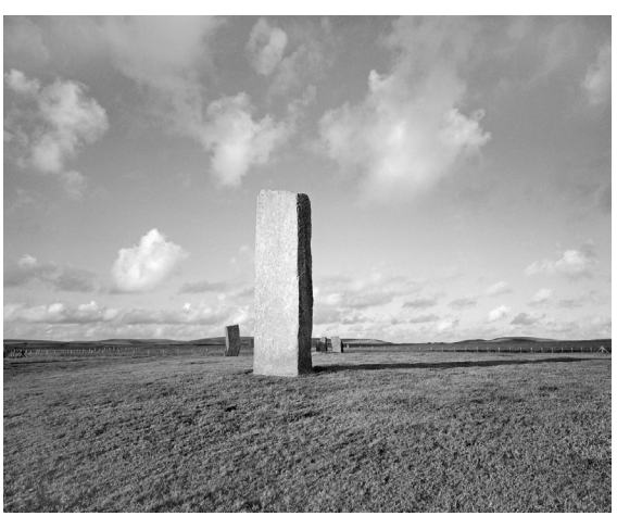
Fig. 13 Stones of Stennes III, 2004, FM 031 from the series "Home of the Gods"

However: In the fine structure that is made visible of an object or of a countenance, something is revealed to the viewer