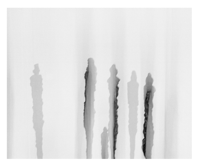
Fig. 14 Skulpture Photo 10, after A. Giacometti "The Forest", 2003, FS 010