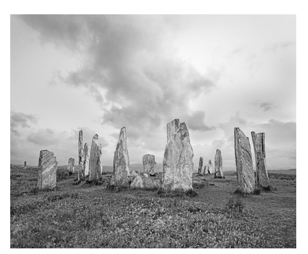
Fig. 11 Calanish Stone Circle II, 2004, FM 041 from the series "Home of the Gods"