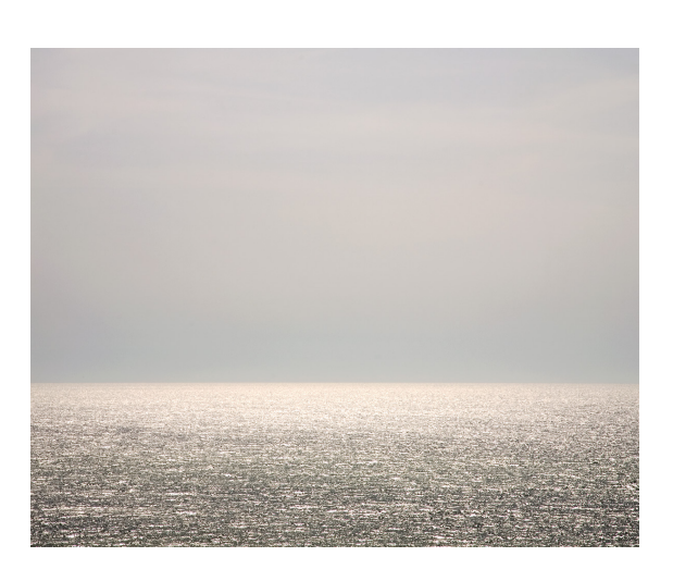
Fig. 6 Horizon 9, 2008, FH 083 from the series "Beginning of Time"

WL – The sequence of my series must be viewed in such a way that the series Beginning of Time is at the very end, taking sixth place. It must therefore be seen symbolically as the primeval mass, as the beginning of human history out of which everything evolved. That is its quality, and thus at this point in time, it may not yet be structure. It is the unformed state, in which no one is living, so-to-speak the primeval state before it was appropriated by humans. The series that follow exemplify human activity in selected areas of human history. This development continues until People Today, which looking from the beginning is the first series of the cycle.