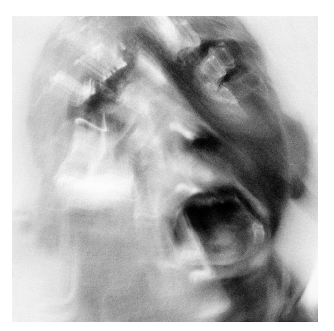
Fig. 4 Skulpture Photo 1, after A. Rodin "The Scream", 2003, FS 001