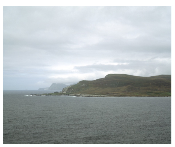
Fig. 3 Irish Light, 2005, FH 037

But there is a good filter for ascertaining what 'art' is for me. That is the time filter. I have viewed many thousands of photographs during my lifetime. However, when I'm away from my bookcase and want to remember certain ones, only about fifty photos cross my mind. Which ones are these? It is an interesting exercise in self-awareness to determine which photographs remain in your visual memory. I would define art as the pictures that – in a positive sense – you don't forget.