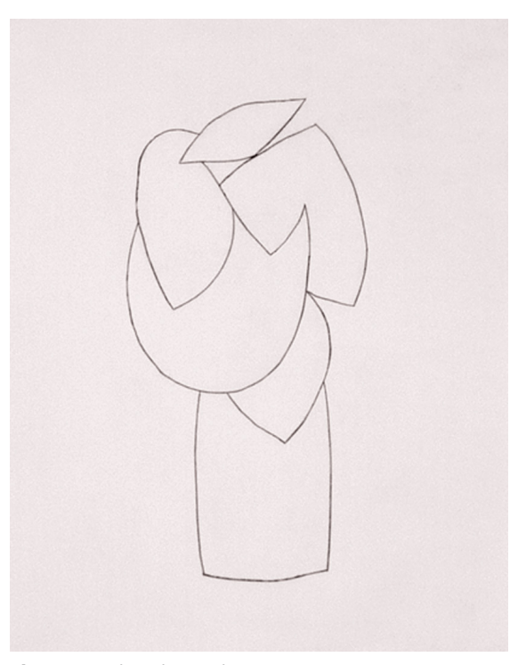
Fig. 10 Waribari, line etching, 1990

For three decades I have devoted myself intensively to photographing landscapes, and during all of these years my unsha-