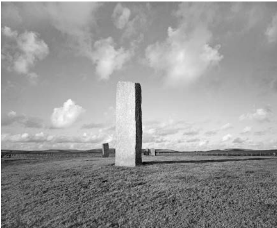
Fig. 13 Stones of Stennes III , 2004, FM 031 from the series "Home of the Gods"

Basically, the format selected has something to do with the character and wisdom of the photographer and the subjects he tends to choose. Of course, the masses of people in Andreas Gursky's photographs or the library pictures of Candida Höfer have more effect in a large format than in 20 x 20 cm, and for Manfred Kage's radiolaria, a format of 4 x 3 Meter perhaps seems out of place in normal exhibition spaces. In MOMA, by contrast, it would have to be considered whether the larger format might be meaningful even for microphotography. The small format also allows you to hold the photographs in your hand, for instance when selecting photographs. You can hold them at arm's length, the right distance for looking at them.