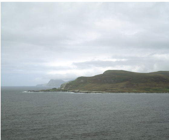
Fig. 3 Irish Light , 2005, FH 037

But there is a good filter for ascertaining what 'art' is for me. That is the time filter. I have viewed many thousands of photographs during my lifetime. However, when I'm away from my bookcase and want to remember certain ones, only about fifty photos cross my mind. Which ones are these? It is an interesting exercise in self-awareness to determine which photographs remain in your visual memory. I would define art as the pictures that – in a positive sense – you don't forget.