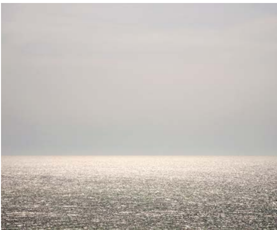
Fig. 6 Horizon 9 , 2008, FH 083 from the series "Beginning of Time"

WL – The sequence of my series must be viewed in such a way that the series Beginning of Time is at the very end, taking sixth place. It must therefore be seen symbolically as the primeval mass, as the beginning of human history out of which everything evolved. That is its quality, and thus at this point in time, it may not yet be structure. It is the unformed state, in which no one is living, so-to-speak the primeval state before it was appropriated by humans. The series that follow exemplify human activity in selected areas of human history. This development continues until People Today, which looking from the beginning is the first series of the cycle.