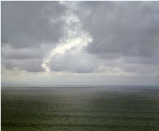
Fig. 2 Horizon 26 , 2008, FH 092 from the series “Beginning of Time”

Nadja Labudda – In describing your photographic series People Today you once wrote that you show man as a “unique individual” – in contrast to Andreas Gursky, whose work shows man in the context of his lost individuality. Is your approach to the theme of man based on a perception of man's individuality that is characteristic of your generation? Or behind the emphatic gaze, is there a conviction – unrelated to generation - which imbues all of your work?