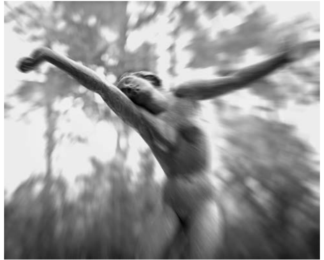
Fig. 15 Skulpture Photo 14 , after G. Kolbe "Fountain of Dancers", 1981, FS 015

which remains hidden in normal presentation. That apparently has something to do with a heightened 'truth of the object' or also with the visible traces of the ageing process, which we unconsciously perceive as a gain of information. But this fine structure cannot be achieved through heightened image sharpness alone. It also involves rendering the finest colour transitions and nuanced shadows. I have experienced this effect especially when looking at the photographs of Jean-Baptiste Huyn, who takes his portraits with the 120 mm macro lens of his Hasselblad.