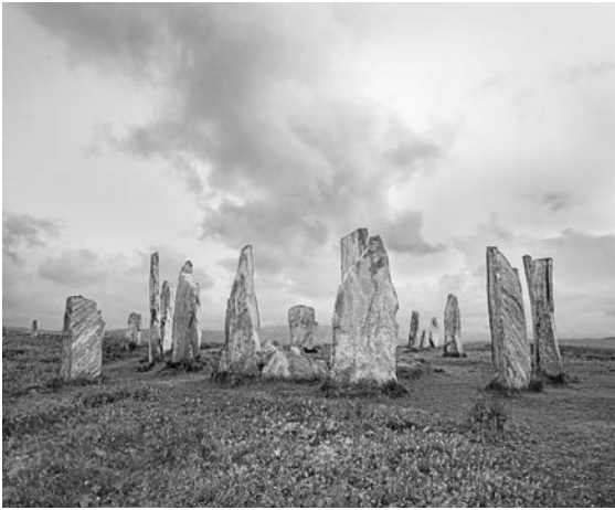
Fig. 11 Calanish Stone Circle II , 2004, FM 041 from the series "Home of the Gods"

ken model has always been Paul Caponigro, the great American landscape photographer. He has the ability to photograph a landscape which at first glance seems completely uninteresting, so that the magic of the creation emanates from it, a talent which only truly great artists have.