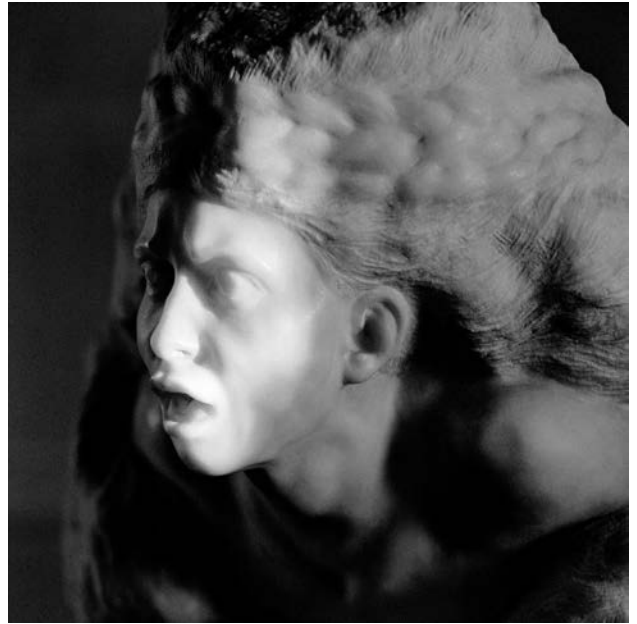
Fig. 5 Skulpture Photo 2 , after A. Rodin The Storm", 1985, FS 002

With this simple formula you can relatively easily distinguish, in your own mind, art photography from holiday photos. You only need to look at a relatively large number of photos, and after two weeks see which ones you still remember. These are then 'art' in the sense that art is what evokes lasting emotions or essential thought-provoking impulses.