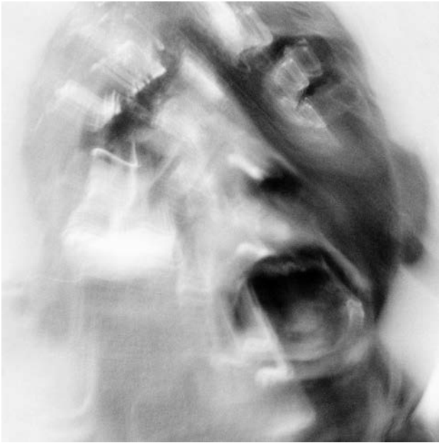
Fig. 4 Skulpture Photo 1 , after A. Rodin "The Scream", 2003, FS 001