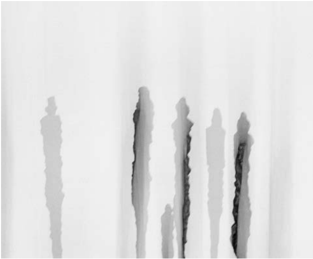
Fig. 14 Skulpture Photo 10 , after A. Giacometti "The Forest", 2003, FS 010