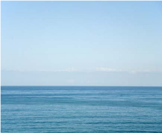
Fig. 7 Horizon 13 , 2008, FH 087 from the series "Beginning of Time"

NL – When looking at the series Beginning of Time, what comes to mind are concepts like endlessness, primeval time, eternity. To what extent is your photography concerned with the dimension of time, and if it indeed plays a role, how is this dimension reflected in other parts of your work?