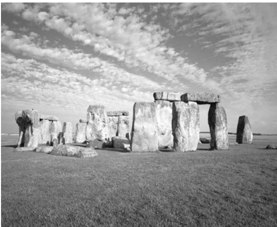
Fig. 12 Stonehenge III , 2002, FM 023 from the series "Home of the Gods"

Then about five years ago I saw the work of the British photographer Michael Kenna. His photographs all have a format of about 20 x 20 cm and have mounts measuring about 40 x 50 cm. I experimented with having my photographs presented in this format and discovered that both the large and small format develop their effect depending on the room in which the photographs are shown and the wall on which they are hung. The smaller room demands a smaller picture, and the smaller picture, when it is well-framed, appears more valuable